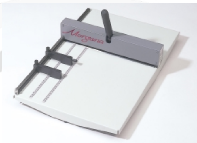
Above: The Morgana Docu-Crease 35.